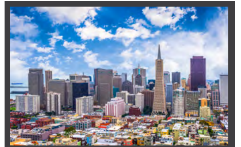
San Francisco, CA

With the acquisition of Simpeo, it allowed us to expand into Birmingham, Alabama. In addition, to better serve our clients nationwide, we opened offices in San Francisco and Los Angeles, California. We look forward to meeting new business owners in these areas and finding ways to make your business simpler, safer, and stronger.