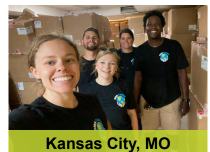
Kansas City, MO

Our Austin, Texas office volunteered with the Championship Hearts Foundation Teen Heart Screening, assisting with guest check-ins, the vitals station, and checking-out duties.